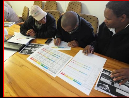
Above: FDI systems course presented at DAFF office in Knysna