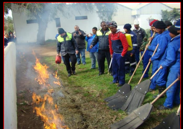
Above: Zoar 1 Day Basic Wildfire Suppression Course

A training day in the George area is also scheduled to take place before the end of the year.