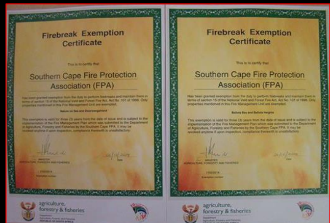
Above: Firebreak exemption certificates

Two firebreak exemptions have been approved in the Victoria Bay and Glentana areas and are the first in the Southern Cape Fire Protection Association region. These exemptions are between two FPA members, which share a common boundary and are valid for 3 years. We would like to thank the deputy director