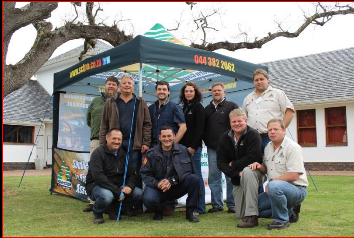
Above: SCFPA & Eden Fire and Rescue personnel at 10th Fire Symposium