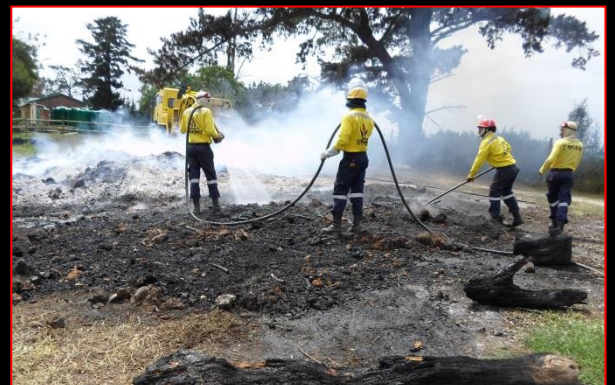
Above: Karatini stack burn - 23/10/2014

These burns and firebreaks give us as the SCFPA and fire brigades another tool to work with, as we know these areas are relatively safe. We would like to advise other SCFPA members to make an effort to increase the fire management of their property where possible.