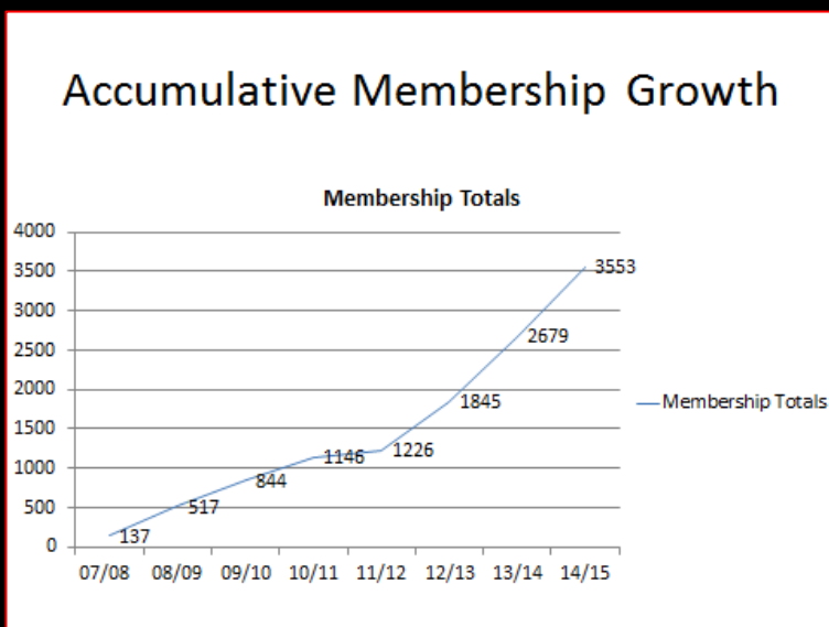
Above: Accumulative Membership Growth

It is wonderful to witness this growth as it contributes to safety and an improved management of the Southern Cape area, concerning veld and forest fires.