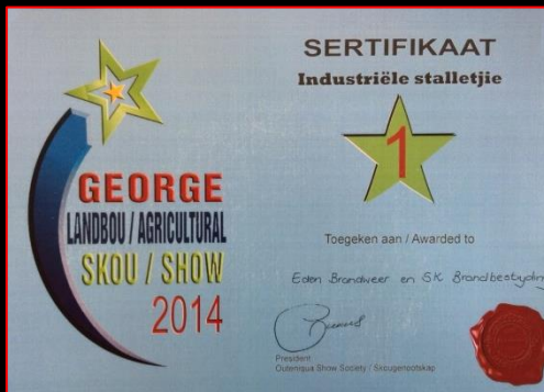
Above: First prize certificate

The SCFPA, in conjunction with Eden fire services, set up a stall at the George Agricultural Show that took place from the 21 st until the 23 rd August 2014. To promote awareness, firefighting equipment and clothing was displayed, as well as many awareness materials. Together with Eden DM, we won first prize for the best stall at the show. On the second day, a very entertaining presentation was given by Eden fire department and the SCFPA Working on Fire teams, where they performed a drill and extinguished a fire with a water drop from the Working on Fire Huey helicopter.