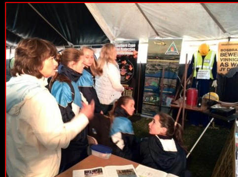
Above: School visit to stall