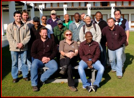
Above: Integrated Fire Management Course presented at NMMU Saasveld campus

Fourteen accredited short learning courses have been sponsored by the GEF FynbosFire project for FPAs and the organisations affiliated with them. In the Southern Cape region to date, 112 individuals, including SCFPA personnel, have received training in 9 different courses namely veldfire behaviour principles, integrated fire management principles, risk analyses, fire danger index systems, community risk reduction, fire ecology and conservation, prescribed burning, basic incident command system and urban interface management. These training courses will lead to better, increased knowledge in the area of veldfires and help improve managing the high risk in this region.