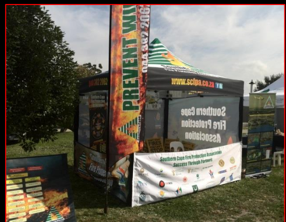
Above: Stall at Fynbos Forum

A stall was also set up by the SCFPA to create awareness relating to veldfires and the Southern Cape Fire Protection Association's responsibility.